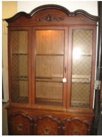
Fine furniture for sale at ReStore