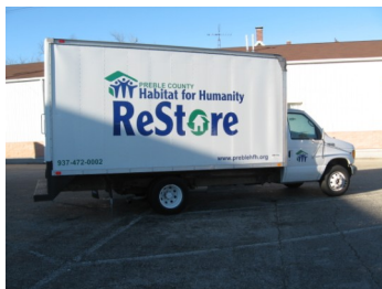
ReStore can pick up your donations

Why should someone consider donating to the ReStore and how are donations accepted?