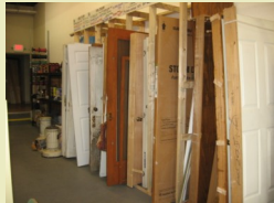
Doors for resell at ReStore promote reuse