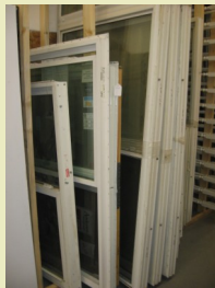
Large window selection