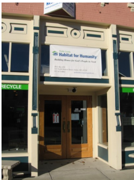
The ReStore storefront in Eaton Ohio next to the Amish furniture store