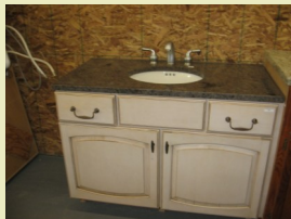
Nice granite topped sinks available here